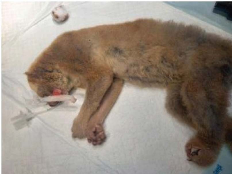
Picture 1. The slow loris under general anesthesia and intubation using endotracheal tube 2.0

There are 2 confiscated Javan slow lorises from local residents which will be prepared for the rehabilitation process, both of them had severe dental conditions in which several experienced crown fracture, both complicated and uncomplicated due to careless clipped out of teeth procedure by illegal trader. All dental treatments are carried out under general anesthesia, including dental examination with a dental probe and explorer, as well as the x- rays. Anesthesia of the slow loris begins with an injection of Ketamine and Acepromazine, followed by the installation of gas anesthesia using Isoflurane through a Size 2.0 Endotracheal tube.