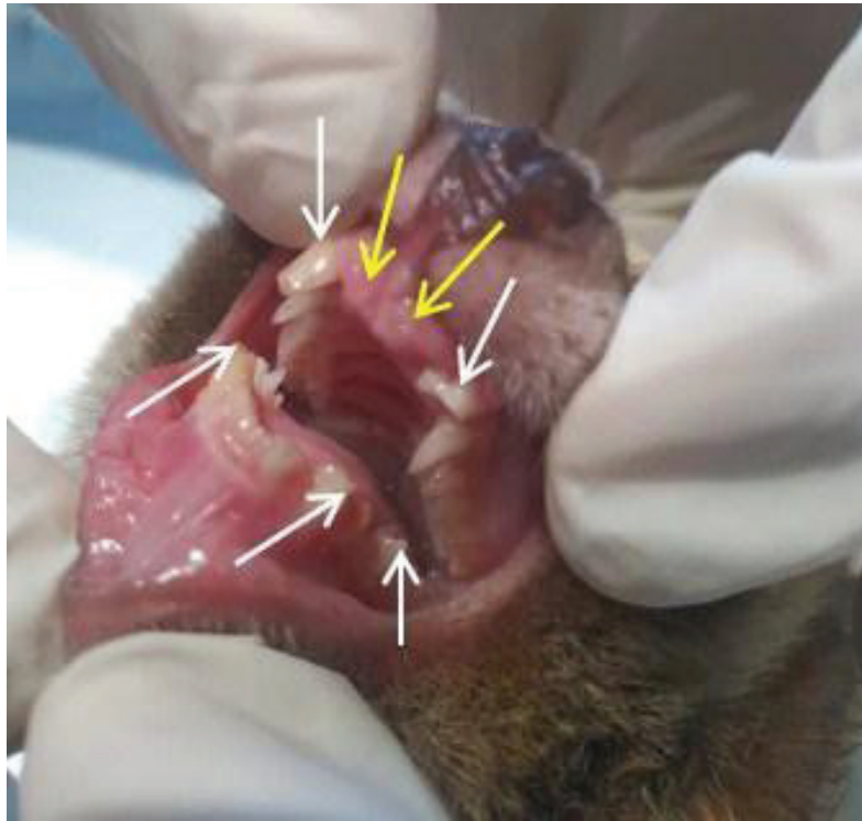
Picture 2. Dental Examination and Dental Charting showed that all four canines and one mandibular premolar (canini like) had complicated crown fractures (exposed tooth pulp) marked with white arrows and two incisors had complicated root fractures (broken and left tooth roots) marked with yellow arrows.

An endodontic procedures, namely root canal treatment, are performed for all the canines of both slow lorises, while exodontic procedures (tooth extraction) are performed for 2 incisors with left roots. All canines are found no peripockets, examined using a dental probe and confirmed with DR x-ray, so it is good to do root canal treatment on all four canines.