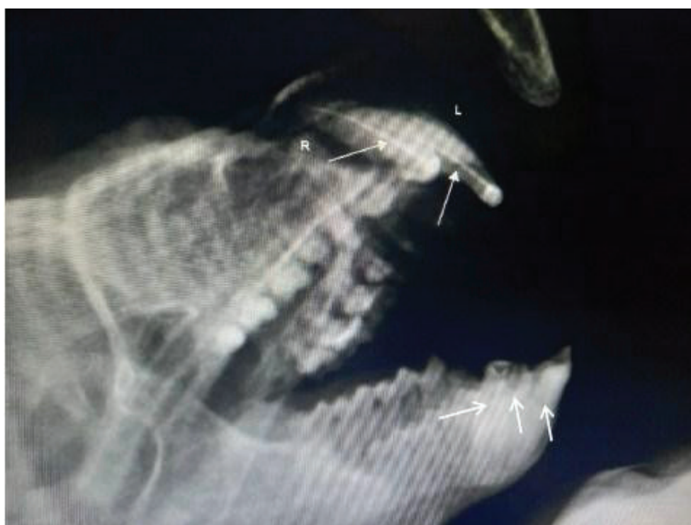
Picture 6. The root canal treatment area is indicated by the presence of obturation material in the root canal with radiopaque appearance (white arrows).

for success of endodontic therapy are generally accepted. These include healing (or at least regression) of recent osseous rarefaction, normal (or only slightly thickened) periodontal ligament space, normal lamina dura, missing evidence of resorption, and a dense and homogeneous three-dimensional obturation of the root canal system, including a sufficient coronal restoration (Kielbassa et al. , 2017). The evaluation post root canal treatment may be seen on picture 6.