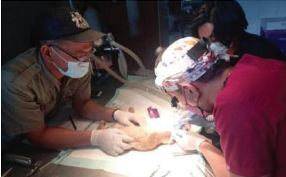
Picture 4. The three main steps of root canal treatment were performed for both slow lorises. The second step is disinfection of root canal. The principals of this step is effective

irrigant delivery and agitation are prerequisites to promote root canal disinfection and debris removal to improve successful endodontic treatment. The main aim is to disinfect the entire root canal system, which requires elimination of microorganisms and microbial components , also prevention of its re-infection during and after treatment. This step is pursued by chemo-mechanical debridement, where the mechanical systems are associated with the irrigating solutions (Plotino et al. , 2016). One of the standard endodontic irrigation protocol is using Sodium Hypochloride (NaOCl) and Chlorhexidine (CHX).